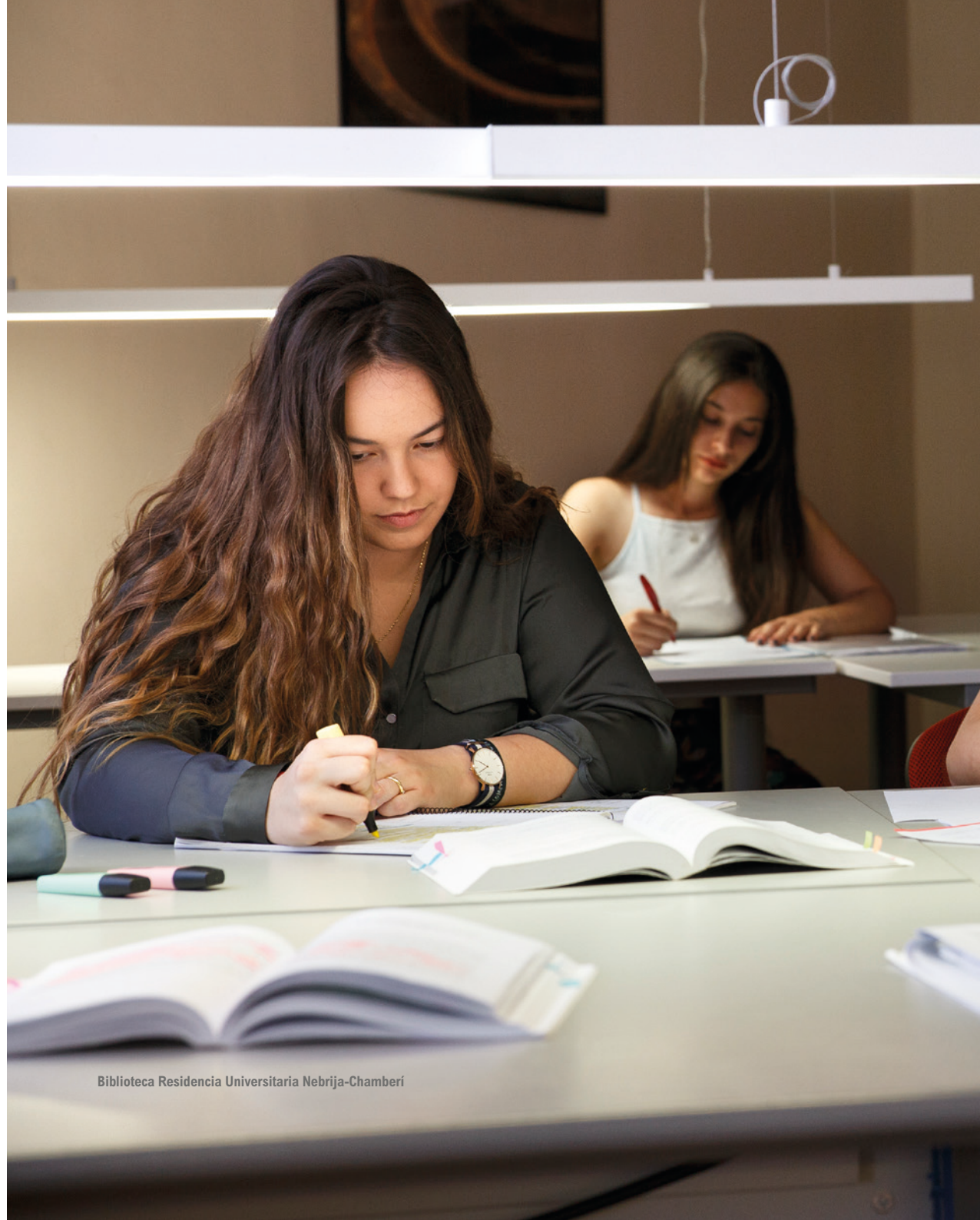
Biblioteca Residencia Universitaria Nebrija-Chamberí

In the months of June and July we receive international students and groups who come to carry out their exchange programs or summer courses at Madrid's universities. This is a wonderful opportunity to meet people from all over the world.