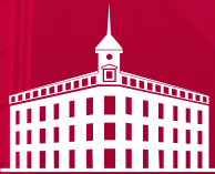
Augustinus-Nebrija University Residence Hall